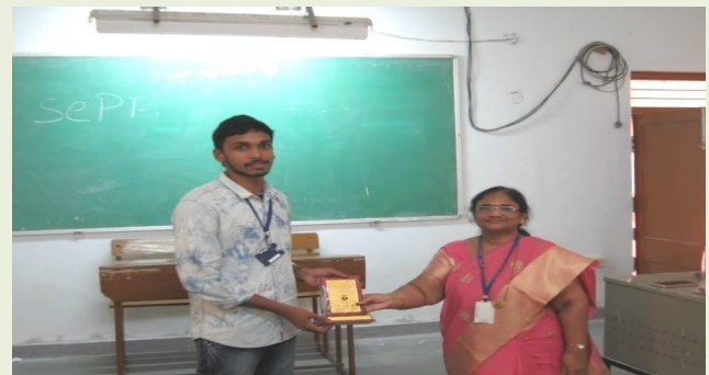
INTAEL a student association Department of IT ,ISTE and CSI Chapter organized Technical Quiz, Astavadhanam, Coding Contest, Technical paper Presentation, Poster presentation and Project your Ideas on 15.09.2017 on the eve of Engineer’s day