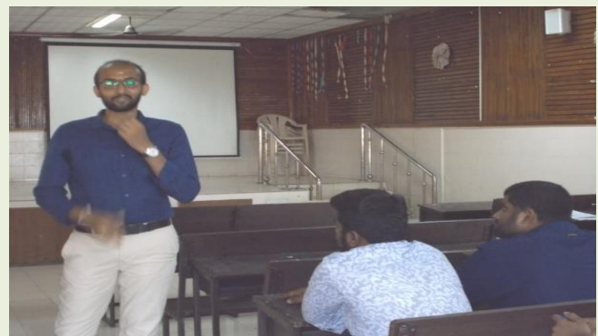
Guest Lectures by Alumni