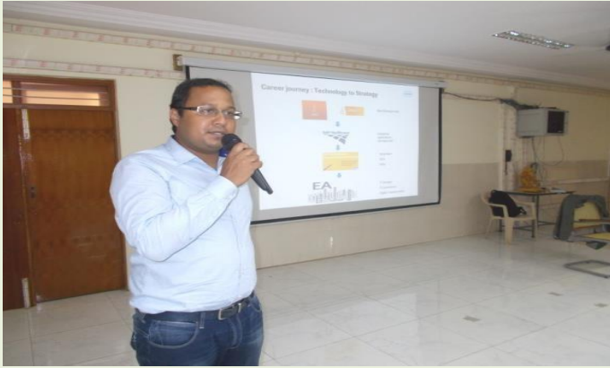
A Guest Lecture on “Time Frequency Analysis of Speech Signals and Speech Application Demo”