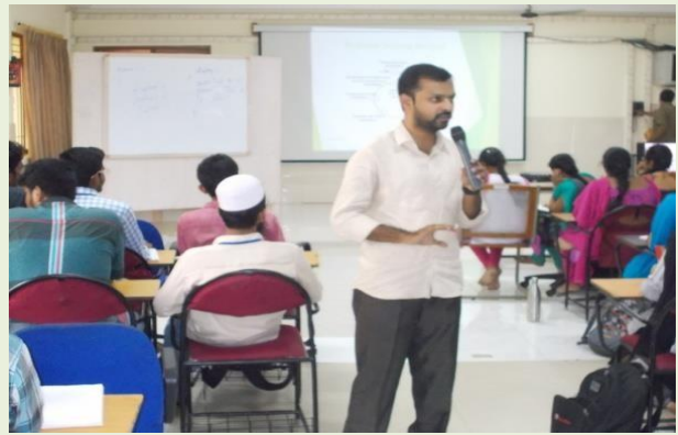
A Seminar on “Fundamentals of C Programming”